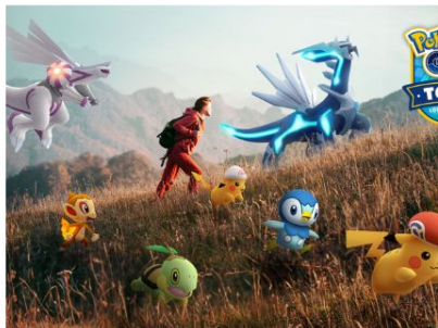
Pokémon GO Tour: Sinnoh to be held at the