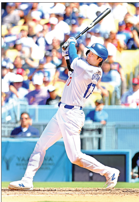
Shohei Ohtani hits his second of two home runs in the Dodgers' victory over the Braves on Sunday.

this year," he said. "I have done it less than in all my past seasons."