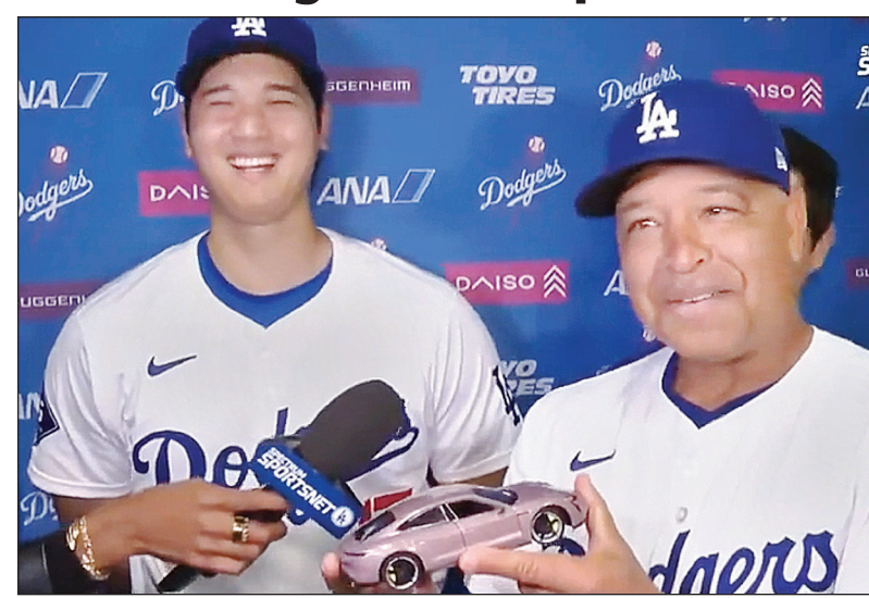
Ohtani laughs as manager Dave Roberts shows off the car he received as a present after his record of most home runs by a Japanese-born Dodger was eclipsed by his two-way star on Saturday.

After passing Roberts on Saturday, Ohtani's postgame press conference was interrupted by his manager, who proudly showed off the new car given to him by Ohtani — a toy Porsche in metallic pink.