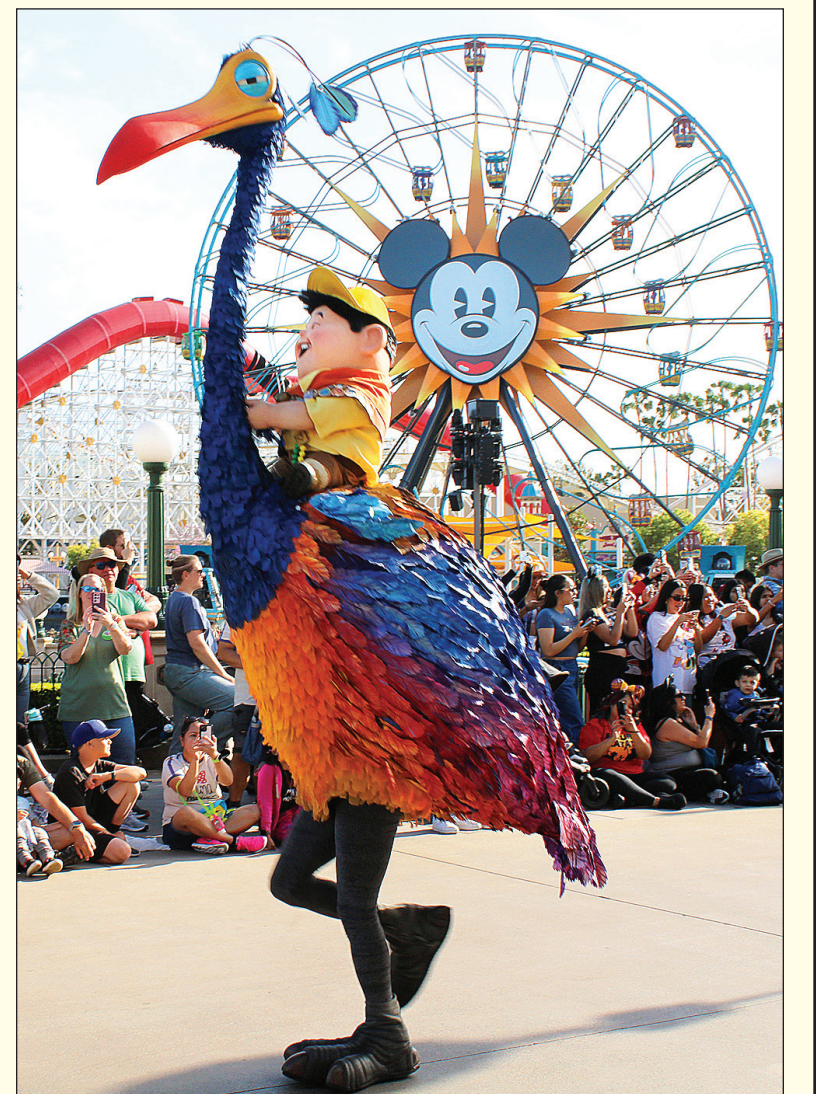
Russell, the determined scout from "Up," rides a colorful bird during the "Better Together" parade. At left, welcome to the "Cars" town.

For more information, go to: https://disney.parks.disney.go.com/au/disneyland/events-tours/pixar-fest/