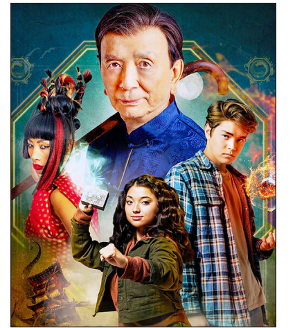
Poster art for "Patsy Lee and the Keepers of the 5 Kingdoms," a labor of love for writer and star James Hong. Hong is one of the most prolific actors in Hollywood history, with more than 600 credits to his name.