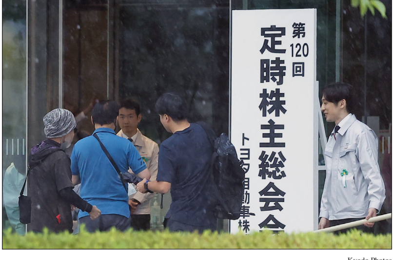
Shareholders of Toyota Motor Corp. arrive at the venue of a general shareholders meeting in Toyota in Aichi Prefecture, central Japan, on June 18.

All the affected models were rolled out when Toyoda was in his previous role as president.