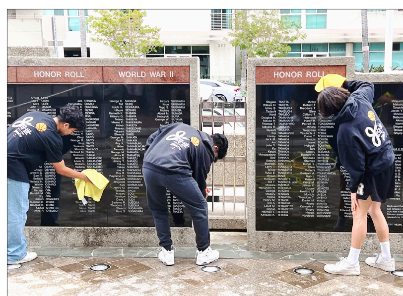
Before they started cleaning, the teammates learned about some of the stories of the soldiers whose names are inscribed on the monument.