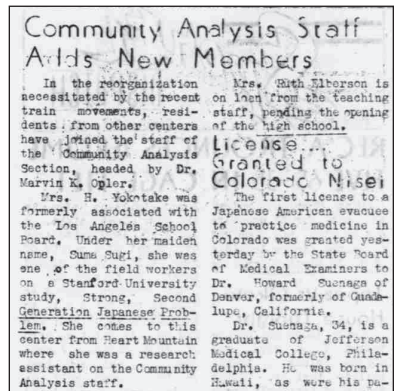
The Tulean Dispatch, Oct. 19, 1943