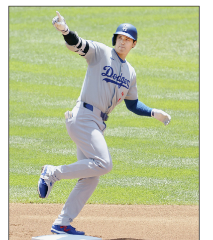
Shohei Ohtani rounds the bases after hitting a leadoff home run in Colorado on Thursday.

The Dodgers were set Friday to host Ohtani's former team, the Angels, in the three-game Freeway Series.