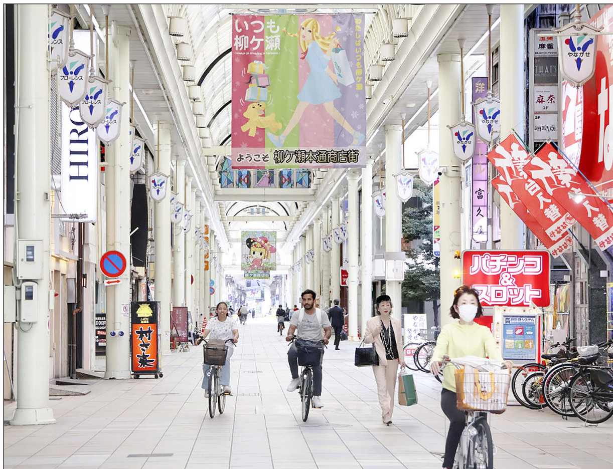
Photo taken on May 29, shows a sparsely populated Yanagase shopping arcade on a weekday in Gifu, Gifu Prefecture.