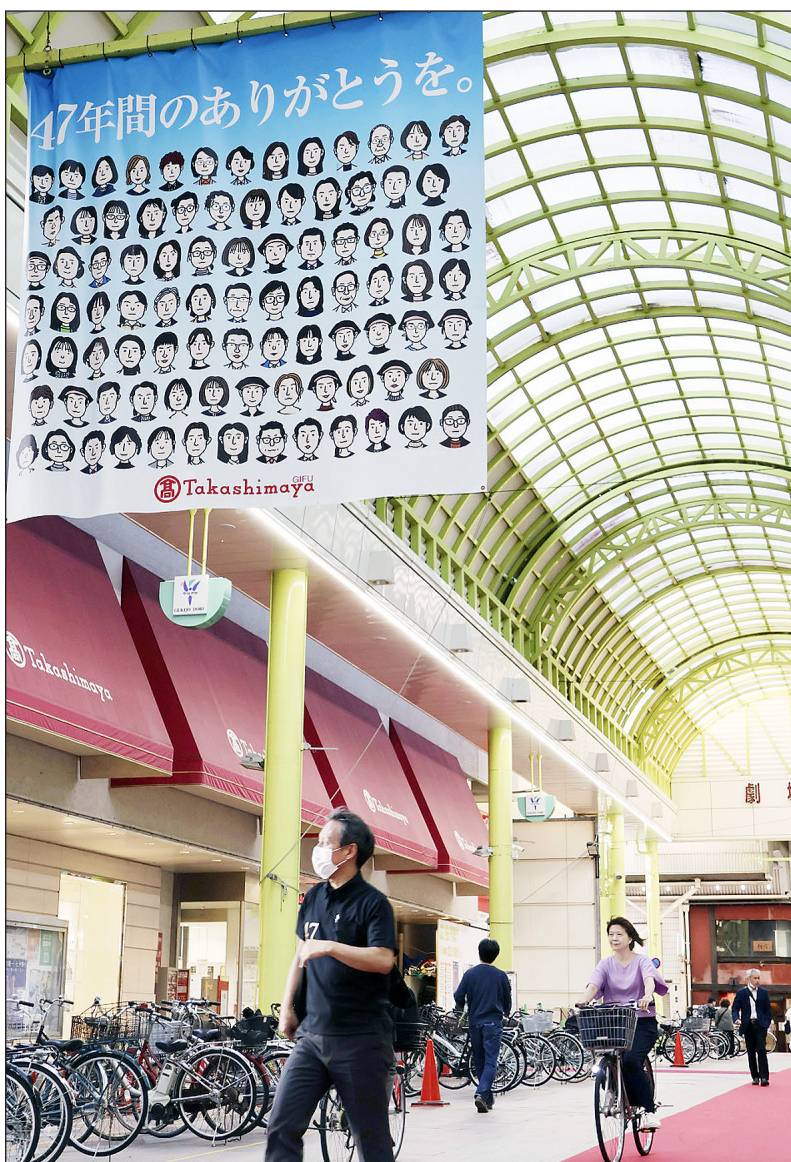
Photo taken on May 29 shows a banner in front of the Takashimaya department store in the Yanagase shopping district in Gifu, Gifu Prefecture, that reads: "Thank you for 47 years of patronage."

Driven by singer Kenichi Mikawa's 1966 million-seller ballad "Yanagase Blues," the district achieved nationwide fame and was so lively at times that people would often be shoulder to shoulder while walking