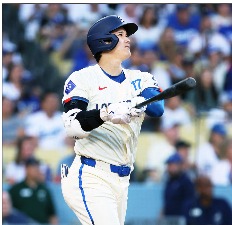
Wearing the Dodgers' new City Connect uniform, Shohei Ohtani tracks the flight of his home run against the Angels on Saturday.